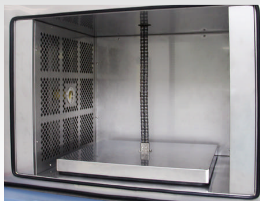
High Temperature Zone