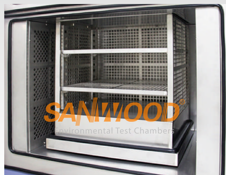
Low Temperature Zone